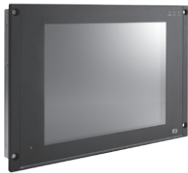
▲ Touch without keypad version