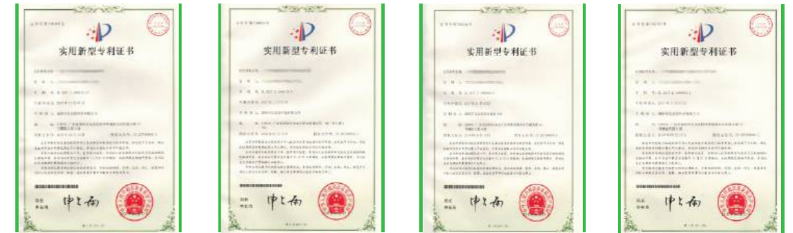
Utility model patent certificate