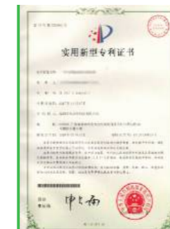
Utility model patent certificate