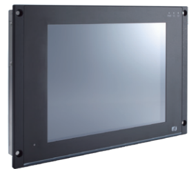
▲ Touch without keypad version