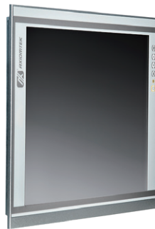
▲ Ultra-slim mechanism design