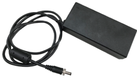
▲ AC power adapter (for GOT110--316-J)