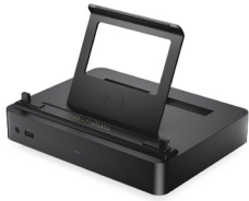
Rugged Tablet Dock