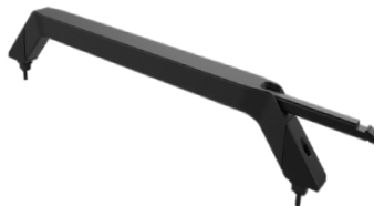
Dell Rugged Extreme Handle