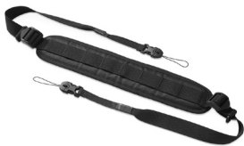
Rugged Shoulder Strap