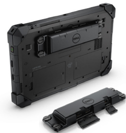
Extended IO Module